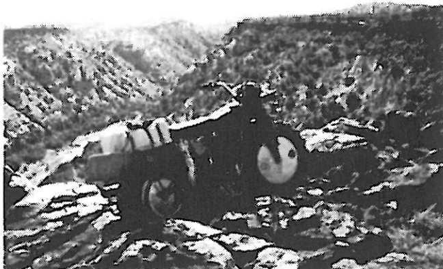
Overlooking the Verdy River.